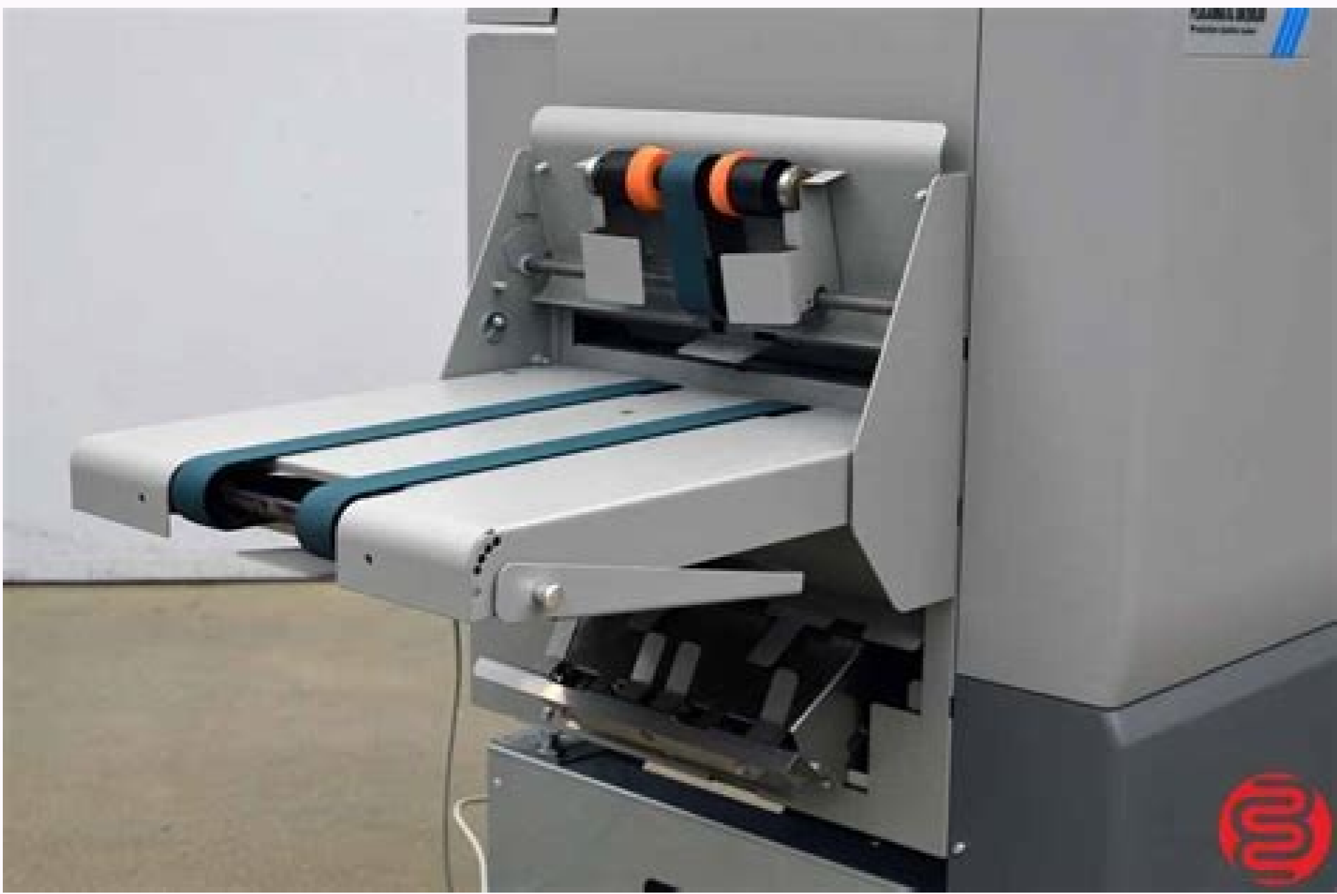
Plockmatic bk5030. Plockmatic bk5030 service manual.